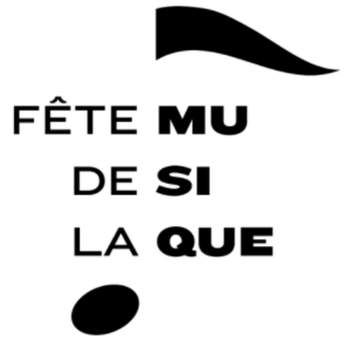
World Music Day Logo

Make Music Day- New York in Brooklyn's Ditmas Park Neighborhood. Musicians played jazz, classical music, and other genres, right from their houses.