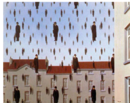
Golconda Oil paint on Canvas 1953