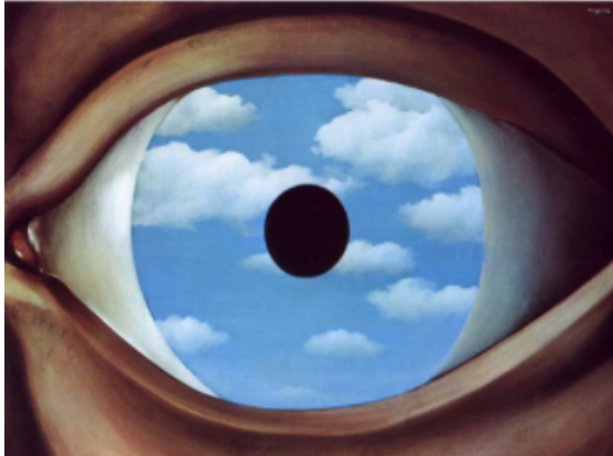
The False Mirror Oil Paint on Canvas 1928