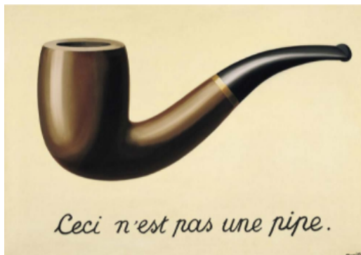
The Treachery of Images Oil paint on Canvas 1928-1929