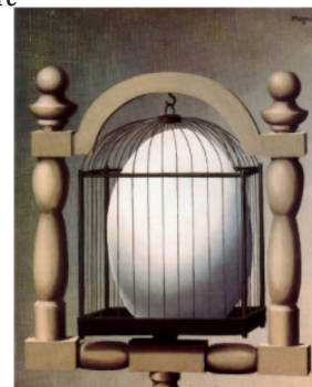
Elective Affinities Oil paint on canvas 1933