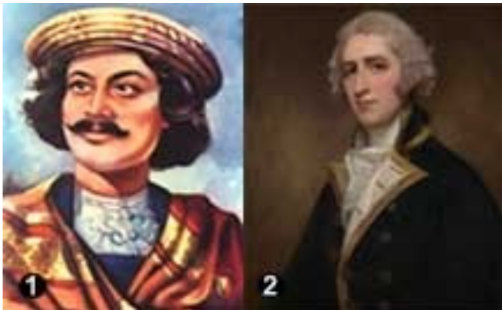
1. Raja Rammohan Roy

Families aim to save up for their daughters' weddings rather than their education and despite dowry having been made illegal in the country, families that don't pay it are rare. Often, when a bride doesn't pay a good amount of dowry, she is mistreated. In urban centers, women are given much more liberty in comparison to their rural counterparts. Women have more control over their careers and choice of partners. Men today are also trying to be of help, like Arunachalam Muruganatham, also known as pad-man, who created a machine to produce sanitary napkins at a low cost to help spread awareness about menstrual hygiene in rural India. Many young men today are also trying to educate themselves on sexism and more men today are feminist unlike their predecessors. Today, because of the great things all of these people did, more and more people are taking up the mantle and fighting for a better world for women.