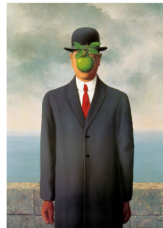
The Son Of A Man Oil Paint on Canvas 1964